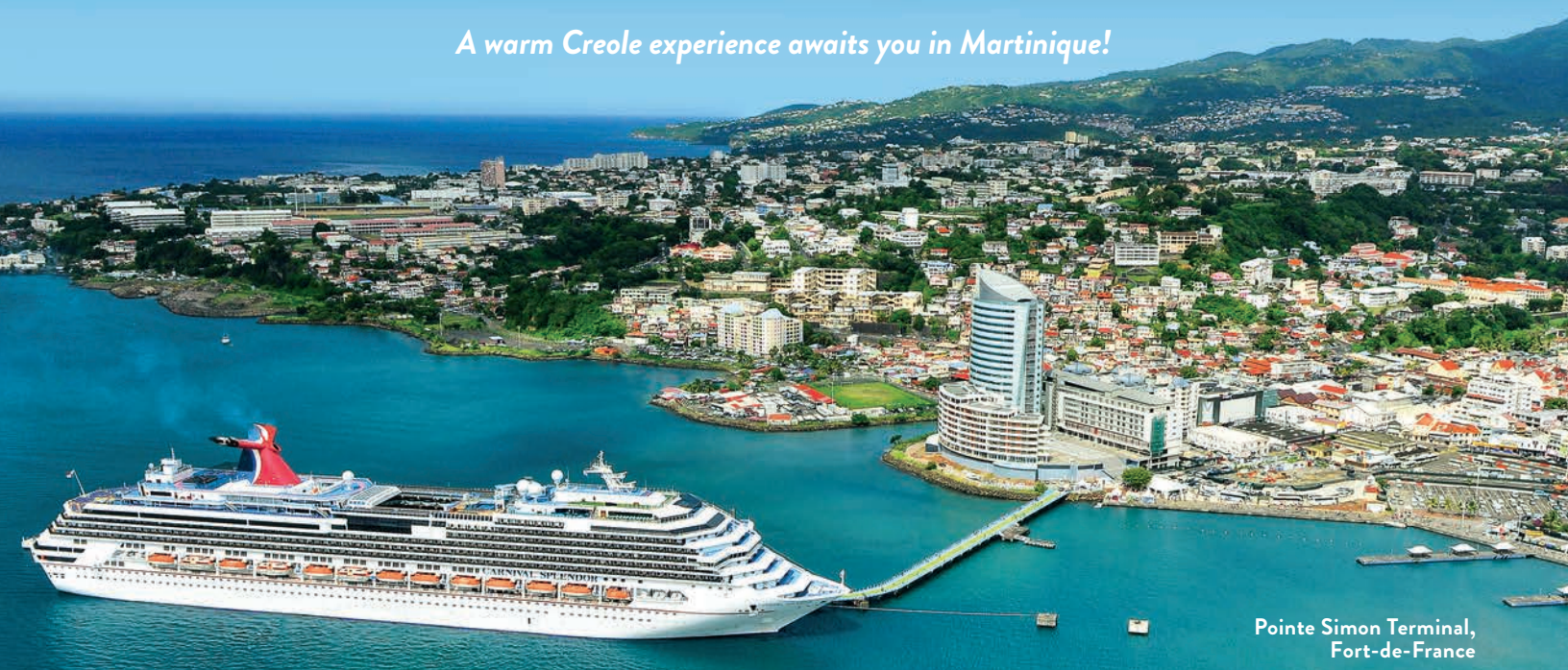
Pointe Simon Terminal, Fort-de-France

A warm Creole experience awaits you in Martinique!