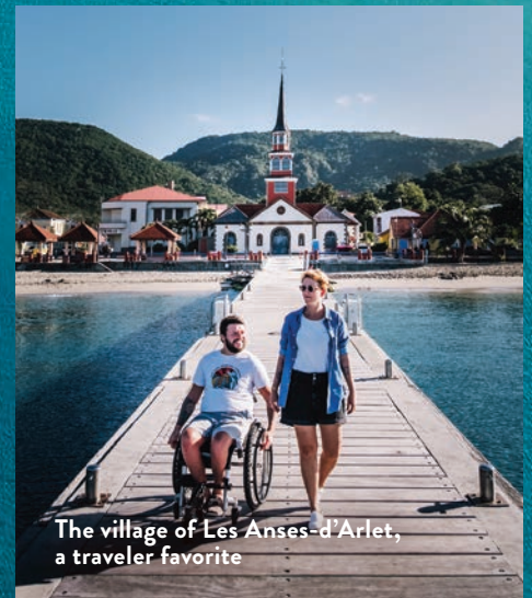
The village of Les Anses-d'Arlet, a traveler favorite